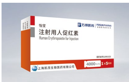
Erythropoietin for Injection (EPO)