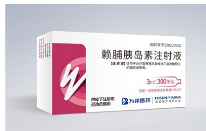
Insulin Lispro Injection

Disclaimer: Products in this catalogue will NOT be supplied for sale in countries/regions which they could be in conflict with valid patents, and the final responsibility lies exclusively with the buyer.