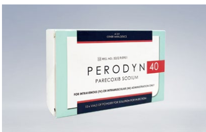
Parecoxib Sodium for Injection