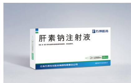
Heparin Sodium Injection