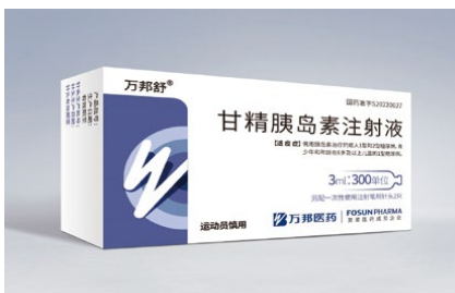
Insulin Glargine Injection